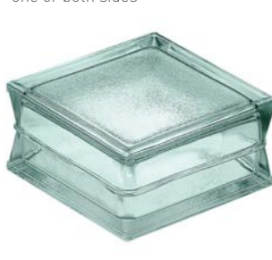
PAVER 190 x 190 x 100