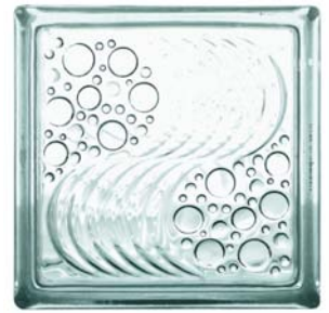
OCEANVIEW 190 x 190 x 80