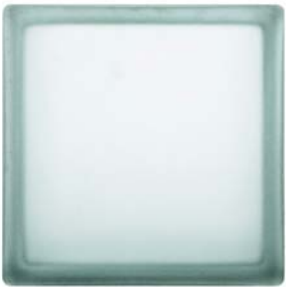
CLEAR ETCHED 190 x 190 x 80 and 240 x 240 x 80