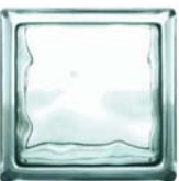
115 WAVE 115 x 115 x 80