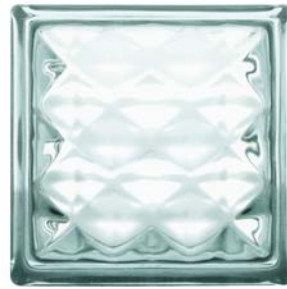
DIAMOND 190 x 190 x 80