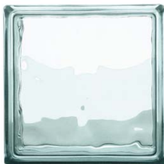
240 WAVE 240 x 240 x 80