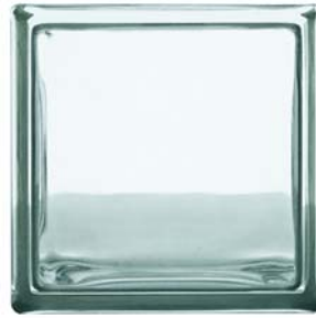
TRANSPARENT 190 x 190 x 80 / 190 x 190 x 100