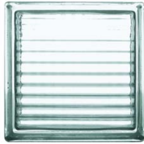
QUADRILLEE/CROSS REEDED 190 x 190 x 80 / 190 x 190 x 100