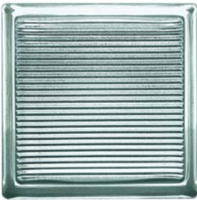
XENON 190 x 190 x 80