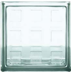
AGORA 190 x 190 x 80