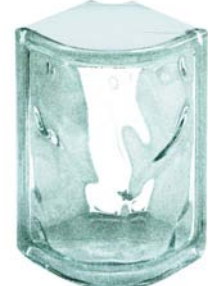
WAVE CORNER 190 x 120 x 80