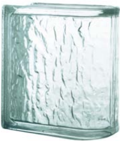
TOBA END 190 x 190 x 80