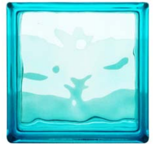
WAVE LIGHT BLUE 190 x 190 x 80