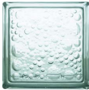
BUBBLE 190 x 190 x 80