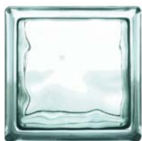
145 WAVE 145 x 145 x 80