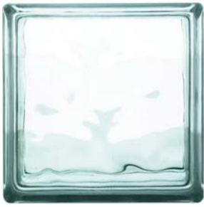
WAVE 190 x 190 x 80 / WAVE HALF 190 x 90 x 80

Mulia Glass Blocks offer a great range of sizes and patterns in traditional & modern blocks to suit any decor. The designer blocks with a Corner, Ends and Double End make any concept possible.