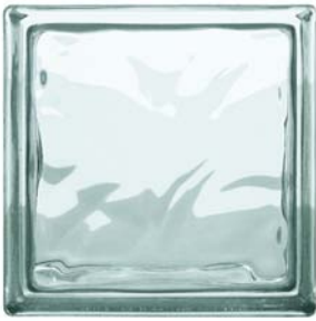
NUAGE/FLEMISH 190 x 190 x 80 / 190 x 190 x 100

La Rochere Glass Blocks are the highest quality French made technical glass blocks that are CSIRO approved for a range of Fire Ratings.