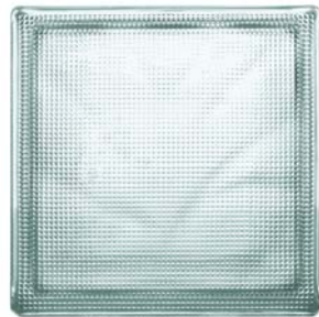
DIAMANT NUAGEE (DIAMANT SIDE) 190 x 190 x 80