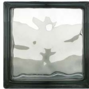
WAVE GREY 190 x 190 x 80