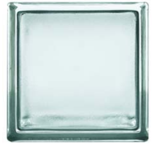
SATINEE/FROSTED 190 x 190 x 80