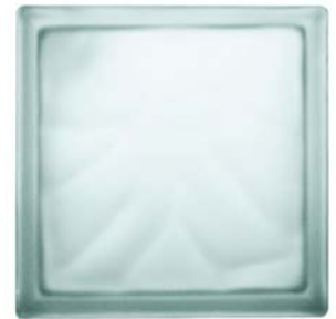
SANDBLASTED Any block can be sandblasted one or both sides