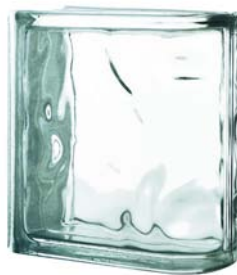
WAVE END 190 x 190 x 80