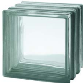
TF60A FRL -/90/60 190 x 190 x 150