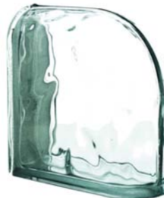
WAVE DOUBLE END 190 x 190 x 80