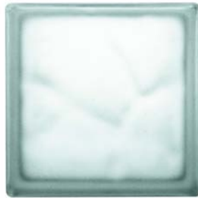
WAVE ETCHED 190 x 190 x 80