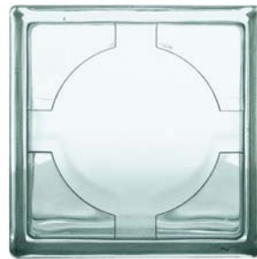
MOZAICO 190 x 190 x 80