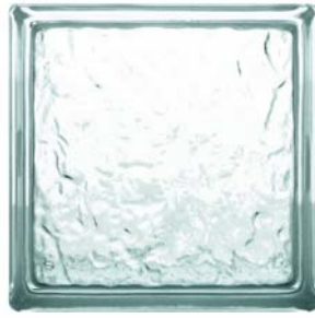
TOBA 190 x 190 x 80 / TOBA HALF 190 x 90 x 80