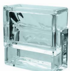
VENTIBLOCK 190 x 190 x 80