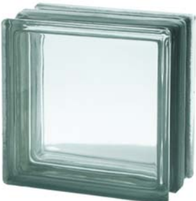
TF30 -/60/30 SECURITY BLOCK 190 x 190 x 100