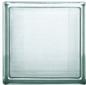
JAVA 190 x 190 x 80