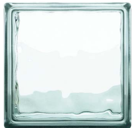
300 WAVE 300 x 300 x 100