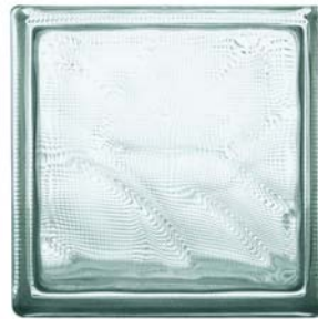
DIAMANT NUAGEE (NUAGEE SIDE) 190 x 190 x 80