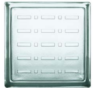
OMEGA 190 x 190 x 80