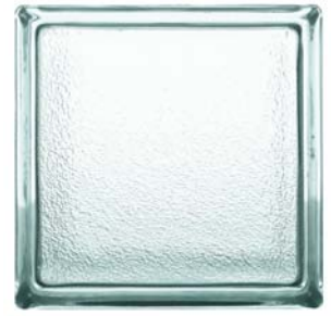
TANGERINE 190 x 190 x 80